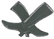
A long black

beautiful long short black grey white cotton leather silk wool